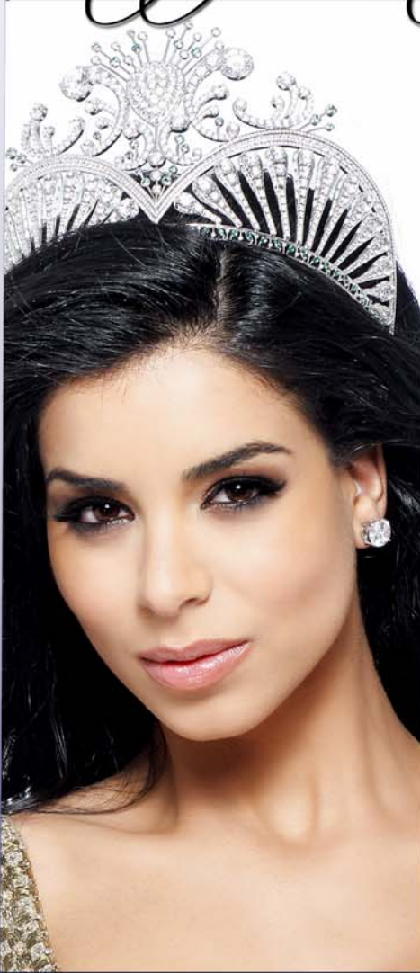
Rima Fakih MISS USA® 2010 Michigan