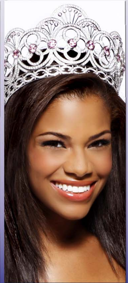
Kamie Crawford MISS TEEN USA® 2010 Maryland