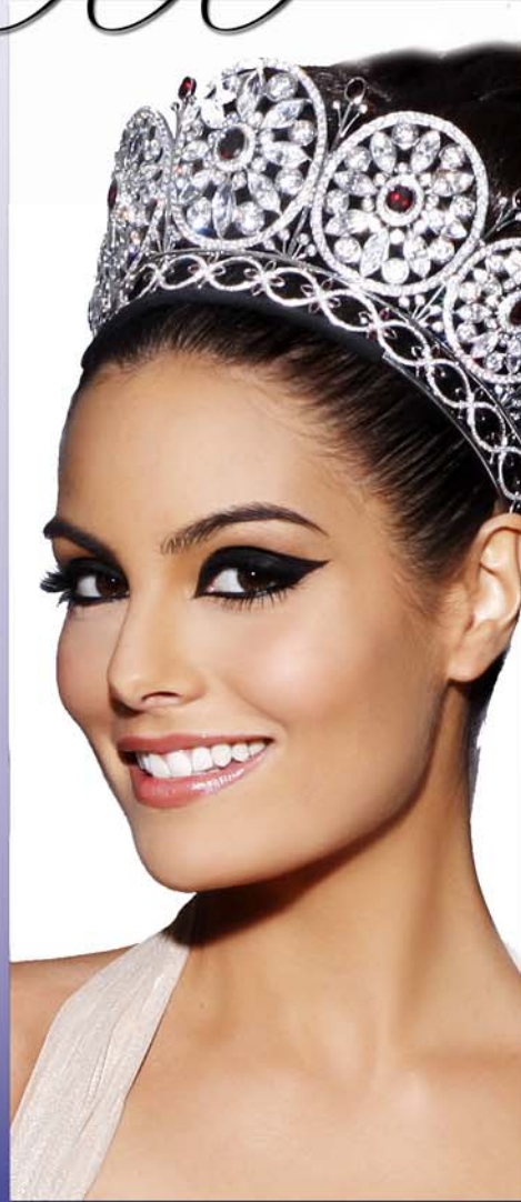
Ximena Navarrete MISS UNIVERSE® 2010 Mexico